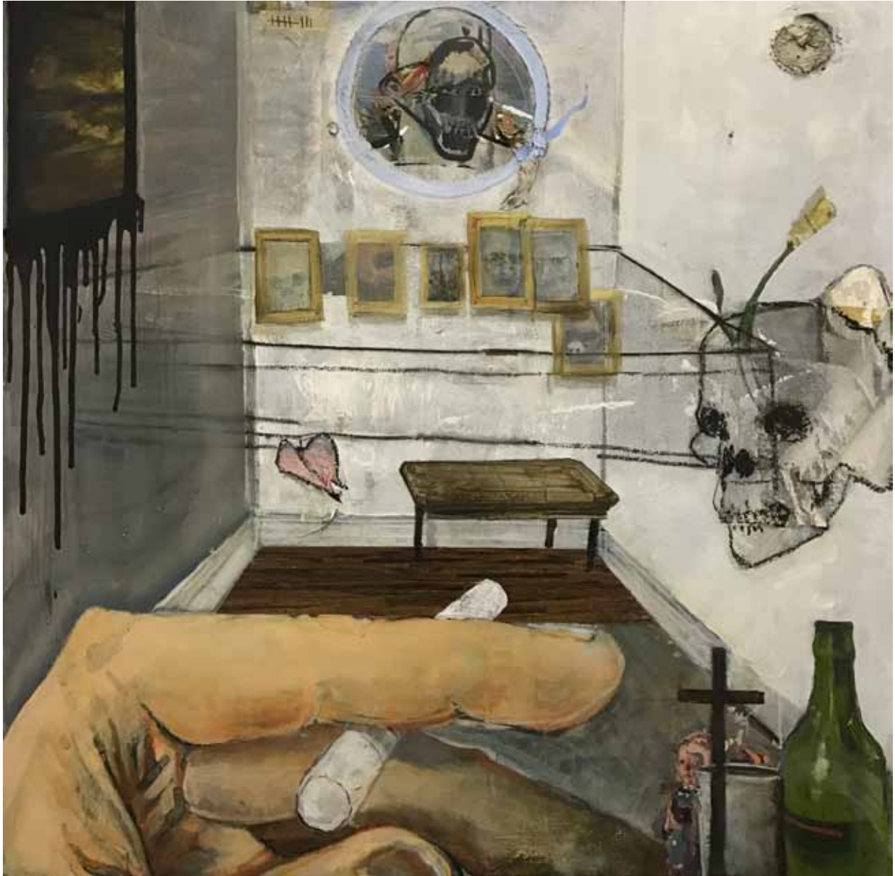
Living Room (family portrait) mixed media on panel 44.5"x44.5" $3200