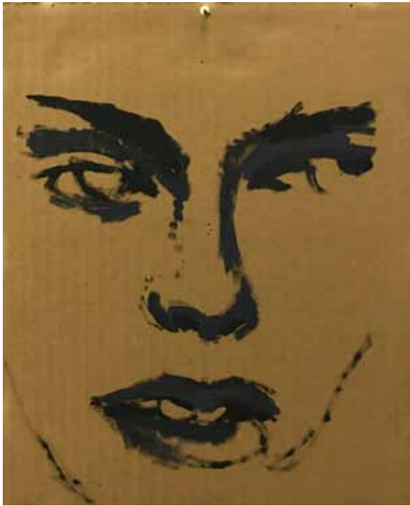
Mask II oil on cardboard 12"x10" $400