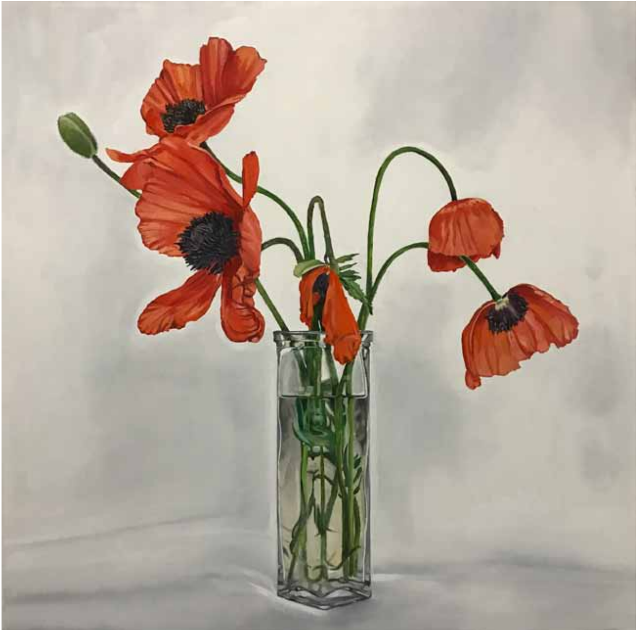
Poppies oil on canvas 44"x44" $2600