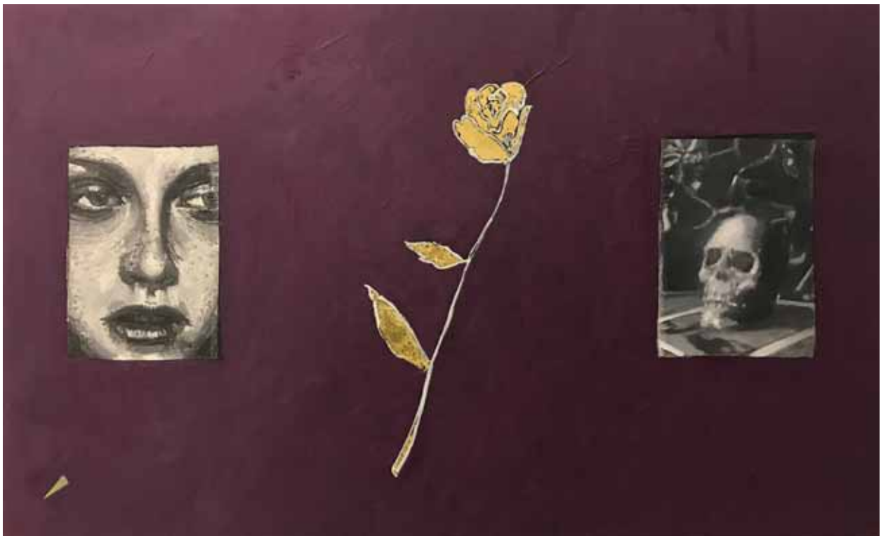
Thorn acrylic, oil, and gold leaf on wood panel 23.75"x39" $1600