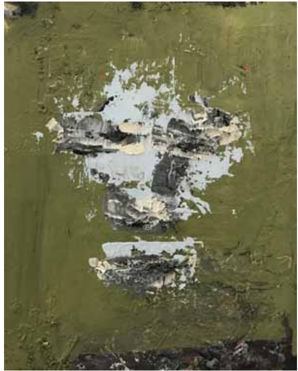
Mask I oil on masonite 10"x8" $400