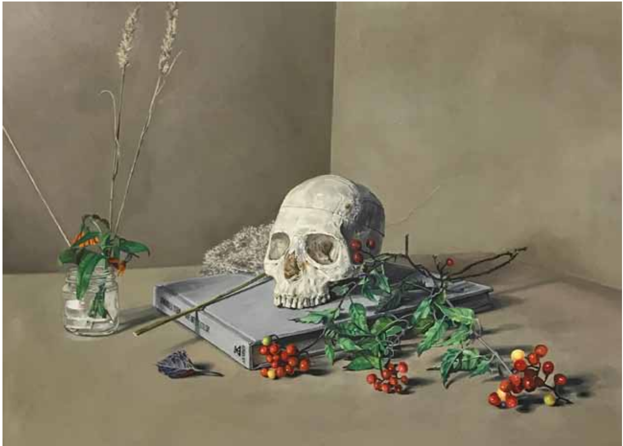
Still Life (for dad) oil on panel 27.75"x38.5" $2400