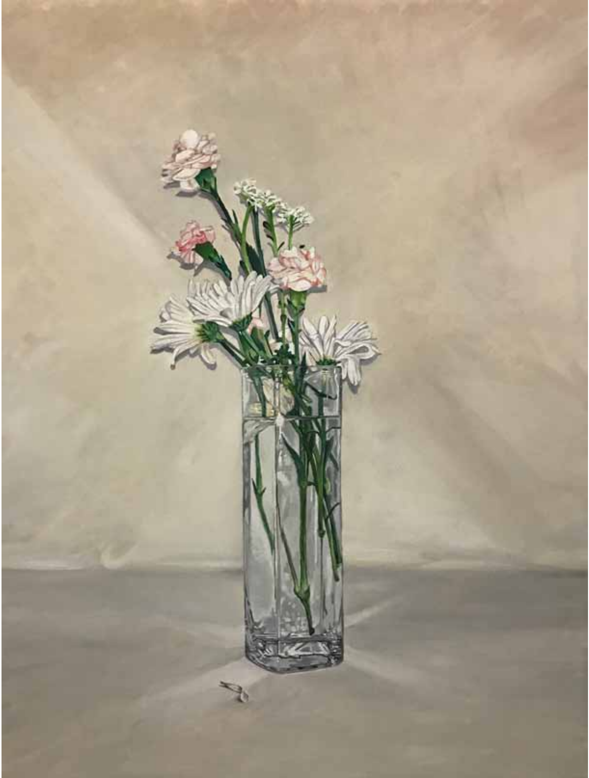
Flowers (for mom)